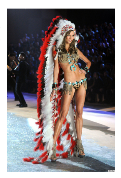
Figure 2. This picture of Karlie Kloss at the Victoria Secret fashion show serves as an example of the hyper-sexualization of Native American women and the misuse of the headdress.

ated community because it interferes with the community's ability to define itself and establish its own identity (Ziff and Rao 8). Native American identity is already a very strained concept and it is difficult to see where best to begin rewriting all the convolution of history. Native Americans have been forcibly assimilated to forget their culture, languages, and self, but as contemporary society today and Native American communities continue to rebuild after all this time, appropriation and stereotypes only further propel this culture into an invisible Otherness. For example, Beck and MacInnis report that Native American outfits and Halloween costumes "draw attention to the hyper-sexualization of First Nations women" (MacInnis). This sexualization is perhaps one of the most popular aspects in the 21st century, as pictures of women lightly clothed in headdresses circulate the Internet constantly. Beck also supports this claim by addressing the Native-inspired bikini and floor length headdress worn by Karlie Kloss on the Victoria Secret catwalk in 2012, as well as the Navajo inspired panties and drinking flasks sold at Urban Outfitters in 2011.