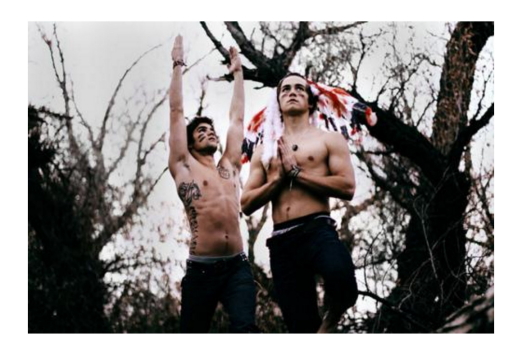
Figure 5. Two young men stand in notable spiritual poses in face paint and headdresses to represent the general association between spirituality and Native American culture (Apihtawikosisa).

can free white Americans from their whiteness, with its stain of Eisenhower, the bomb, and the corporation (9). Murphy suggests that Native American culture represents a pre-colonized America—genuine, peaceful, and pure—and therefore, the hipster subculture wishes to embody these characteristics, while still maintaining the economic and social mobility granted by their privileged majority backgrounds (5). Murphy claims that, not only do these hipsters make attempts to identify themselves, but also that they wish to breathe in new life and new modes of self-expression because ethnicity becomes a spice or seasoning that can liven up the dull dish that is mainstream white culture (6). Murphy observes one universal defense for this trend in question given by the demographic in question: "but I just think it's cool" (9). Murphy claims that nothing is ever just cool; there is always an unconscious structure to it all, like the unspoken connotation of the feather headdress, the chieftain, and the dream catcher, that represent exotic freedom and purity.